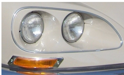
Figure 2: Headlamp on a Citroën DS with U.S. “Sealed beam” configuration