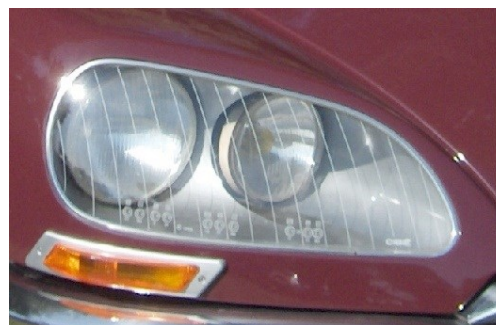
Figure 3: Headlamp on a Citroën DS with European “Sealed beam” configuration